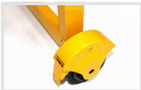
Wheels For Easy Manoeuvrability