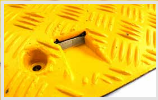
Reflective Cats Eyes