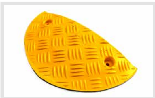
Speed Ramp End Section