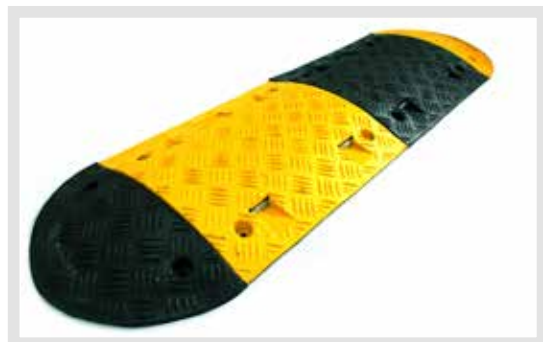
Multicoloured Speed Ramps & Ends Joined