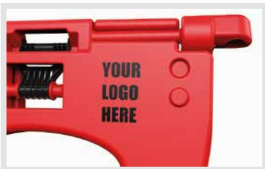
Have Yourr Own Logo Embossed