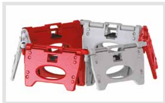
Interlock At Angles To Form Circles