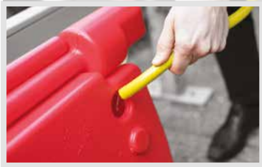
Can Be Water Filled