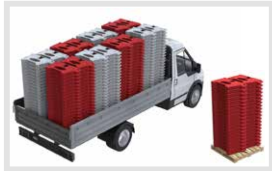
Stack 40 Barriers Per Pallet