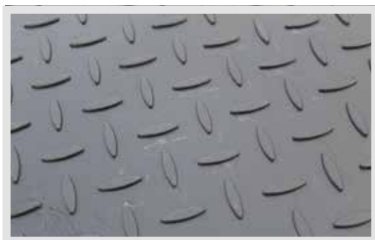
Machinery / Pedestrian Tread Pattern