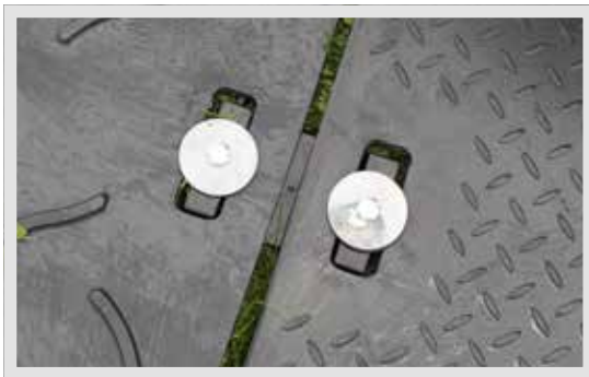
Multi-Sided Interlocking Mats