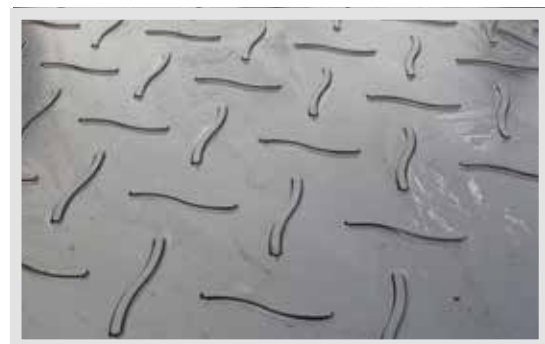
Heavy Duty Vehicle Tread Pattern