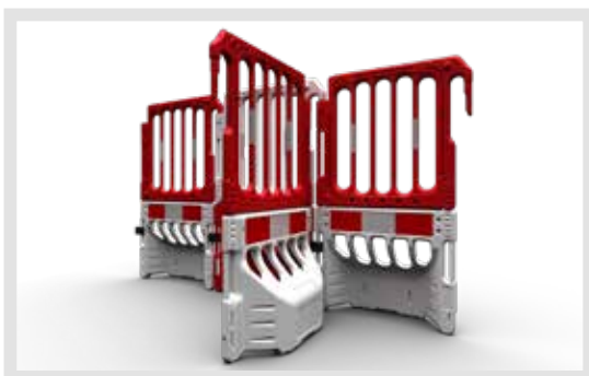
Inter Directional Connection