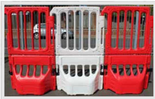
Row Of Joined Buddha Barriers