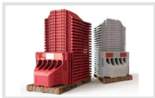
Easy To Stack