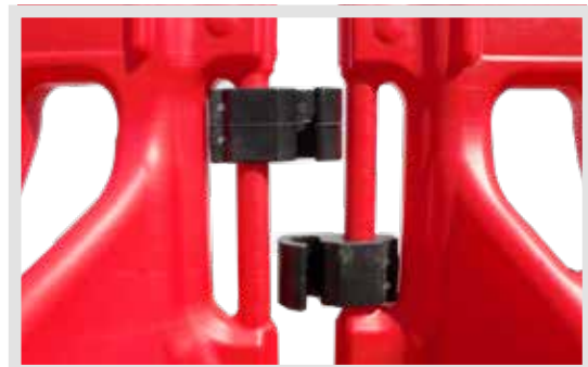
Buddha Connection Clips