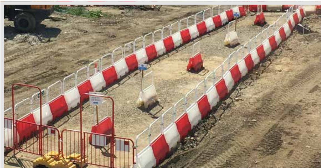
Mesh Fence Add-On In Use On Site