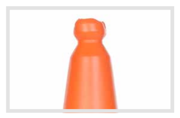
Blow Moulded Hand Grip