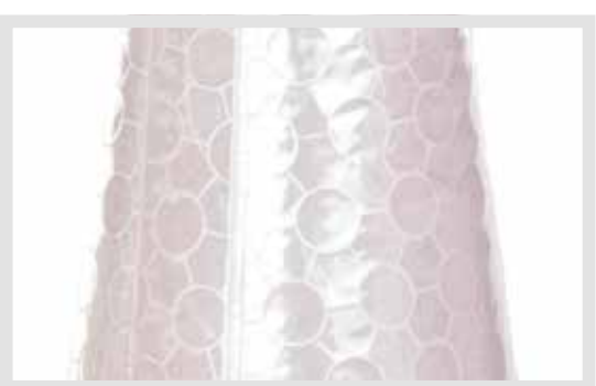
Highly Reflective Sleeve