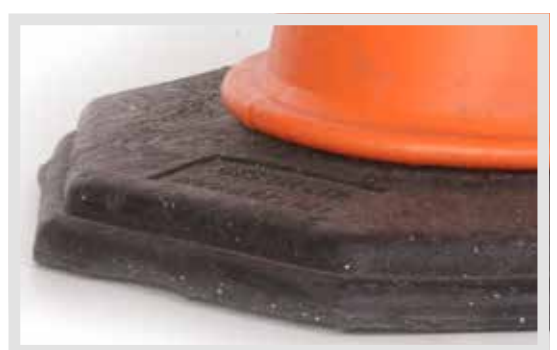
Recycled Rubber Base