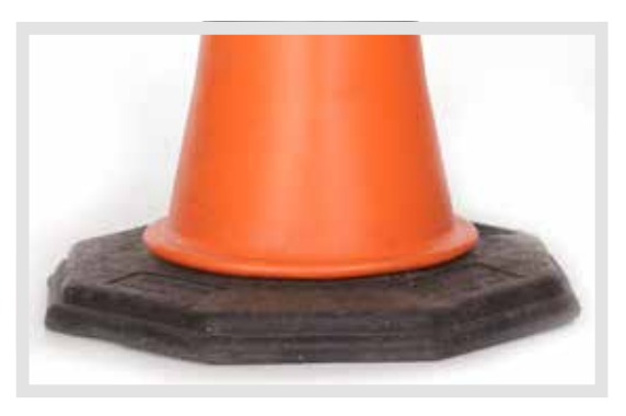
Detachable base / body