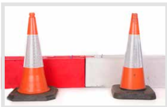
A Robust Supplement To Standard Cones