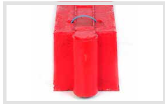
Male Connection End