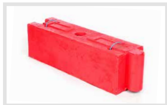
Rope Carrying Handle & Hole Insertion Point