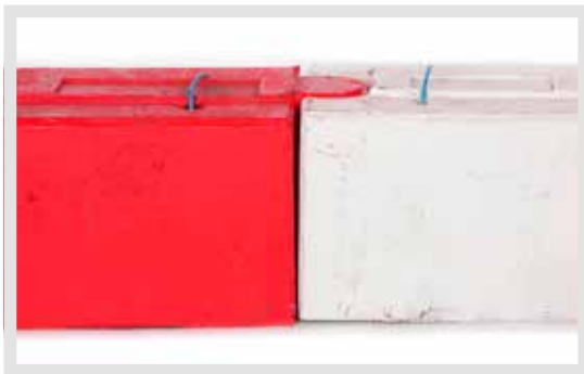
Each Traffic Log Interlocks