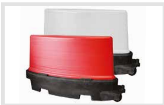
Road Runner Available In Red And White