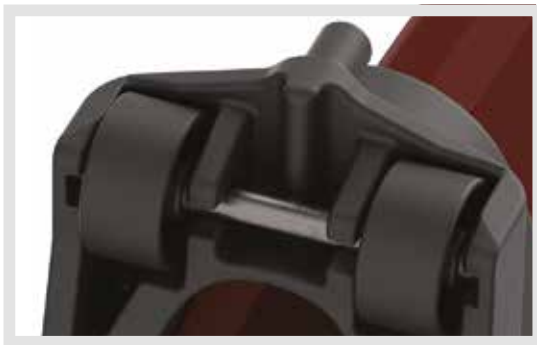
Wheels For Ease Of Manoeuvring