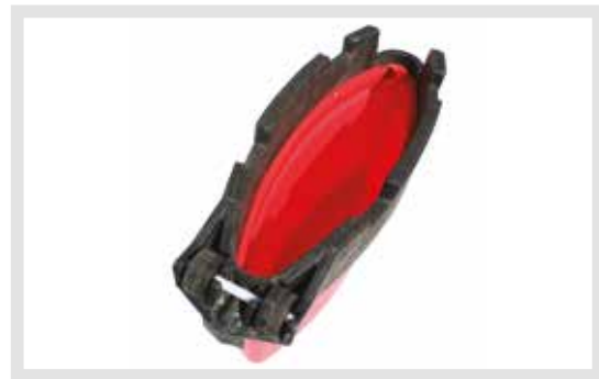
Hollow Inside Makes Stacking Quick And Easy