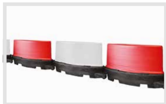
Interlock Quickly And Easy To Form A Row