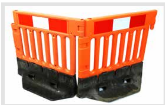
Interlocking Barriers Can Easily Form Curves