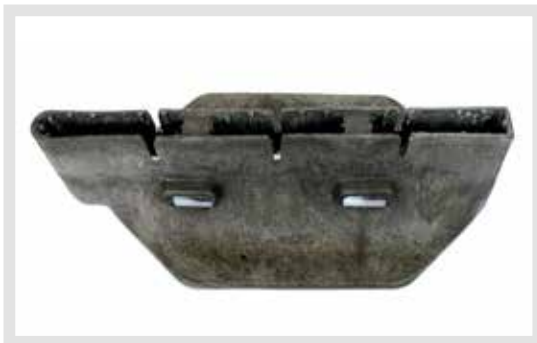
Robust Rubber Base Provides Solid Footing