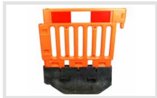
Barrier Section Simply Slots Into Rubber Base