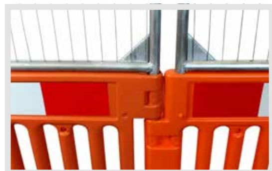
Fence Add-On Slots Directly Into Barrier