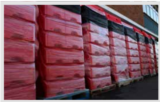
HOG600 Barrier Stacked 21 Per Pallet