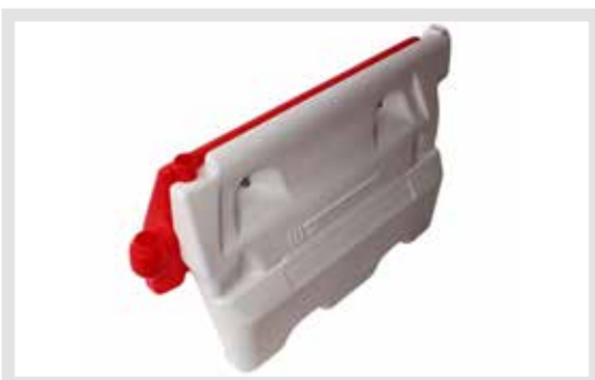
HOG600 Barrier Multi Sided