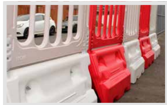
HOG600 Barrier With Fence