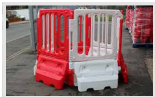
HOG600 Barrier Boxed